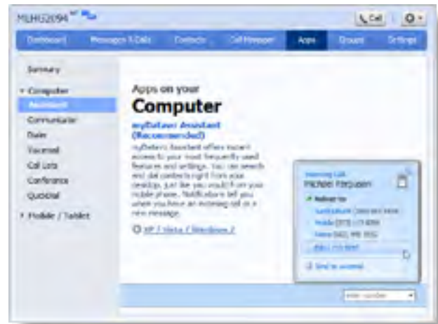
Click-to-dial from myDatavo Assistant or launch myDatavo